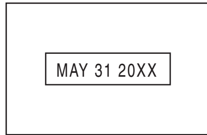
2910-P05 1-3/8" x 2-1/8"