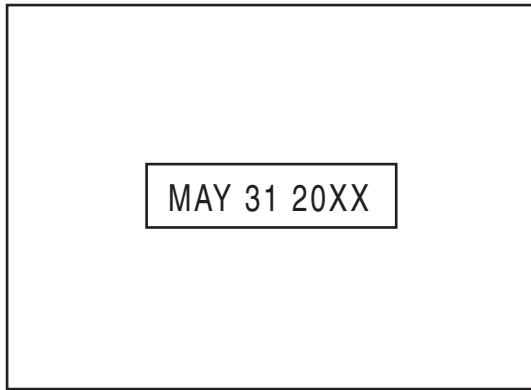
2910-P10 2" X 2-3/4"