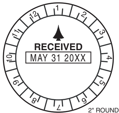
TRODAT 12HR TIME STAMP